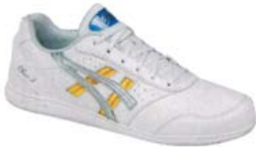
ASICS-ADULT CHEER 8 AS4601 (ADULT) $41.99 AS4250 (YOUTH) $37.99

WHITE W/COLOR CARDS, 10.1oz. ADULT SIZES: 5-11, 12 YOUTH SIZES: 10, 11, 12, 13, 1, 2, 3