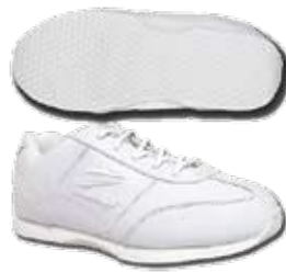
ZEPHZ-TUMBLE CH0031(YOUTH/ADULT) $25.99 Red, yellow, green, blue and black laces included YOUTH SIZES: 8, 9, 10, 11, 12, 13, 1-2.5 ADULT SIZES: 4-11, 12, 13

ADULT SIZES: 4-11, 12 YOUTH SIZES: 10, 11, 12, 13, 1, 2, 3