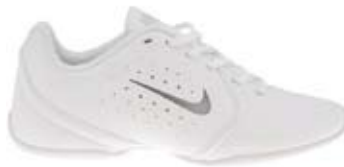
NIKE-SIDELINE IV AS4601 (ADULT) $59.99 AS4250 (YOUTH) $46.00

WHITE W/COLOR CARDS, 10.1oz. ADULT SIZES: 5-11, 12 YOUTH SIZES: 10, 11, 12, 13, 1, 2, 3