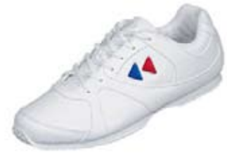
KAEPA-CHEERFUL KP6315(ADULT) $28.99 KP63155 (YOUTH) $28.99 WITH SNAP IN LOGOS ADULT SIZES: 4-11, 12 & 13 YOUTH SIZES: 10, 11, 12, 13, 1, 2