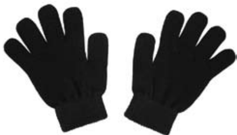
KNIT GLOVES $2.50

One Size Fits All STOCK: BLACK, GOLD, PINK, PURPLE, RED, ROYAL, SILVER, WHITE