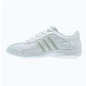
ADIDAS TRIPLE CHEER SHOE KP6315(ADULT) $42.95 KP63155 (YOUTH) $32.95

ADULT SIZES: 4-11, 12 YOUTH SIZES: 10, 11, 12, 13, 1, 2, 3